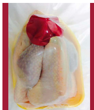
GL201 Eviscerated hen tray